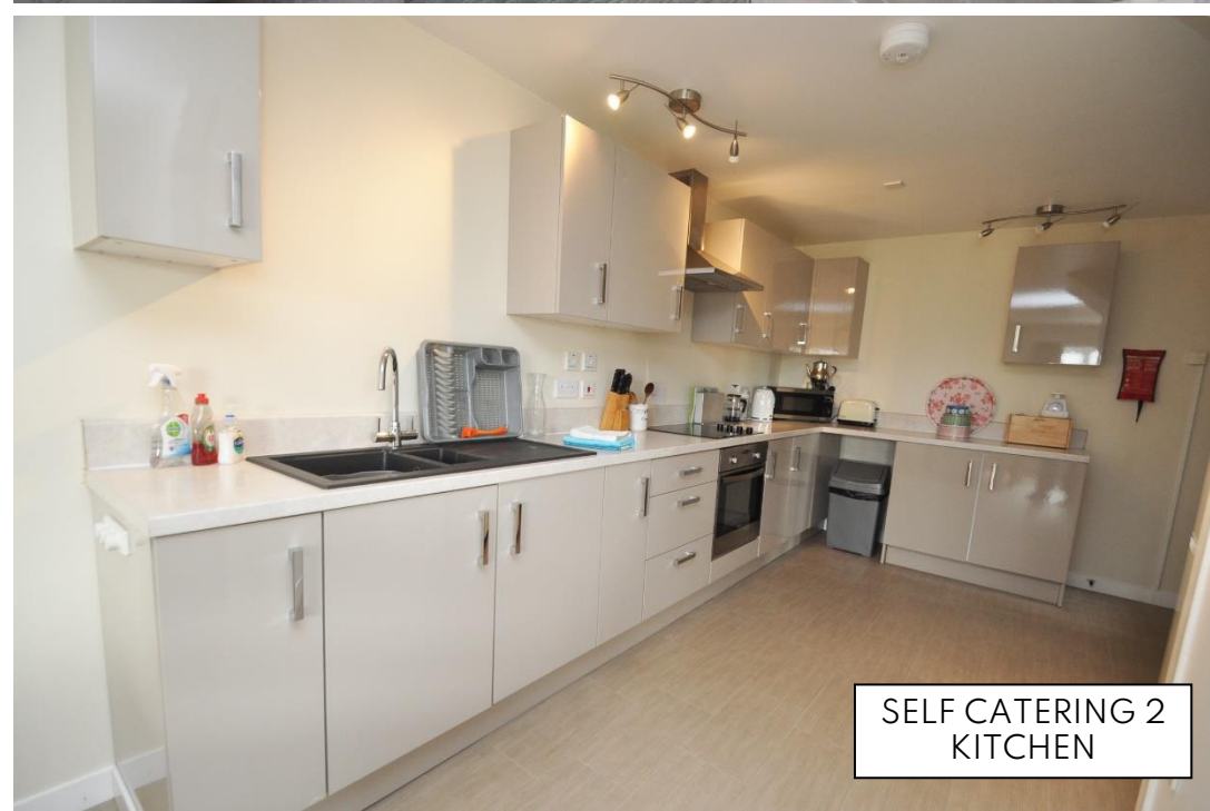
SELF CATERING 2 KITCHEN