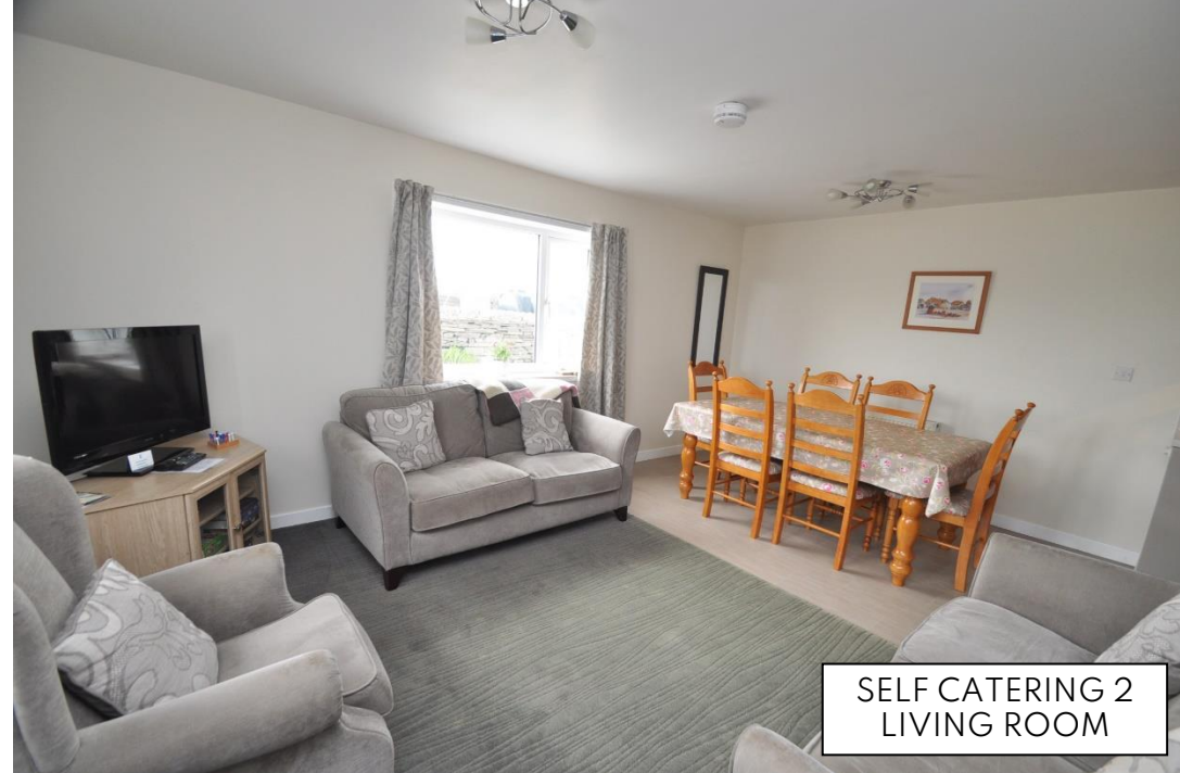
SELF CATERING 2 LIVING ROOM

The island is connected to the Orkney Mainland via scheduled ferry and air services.