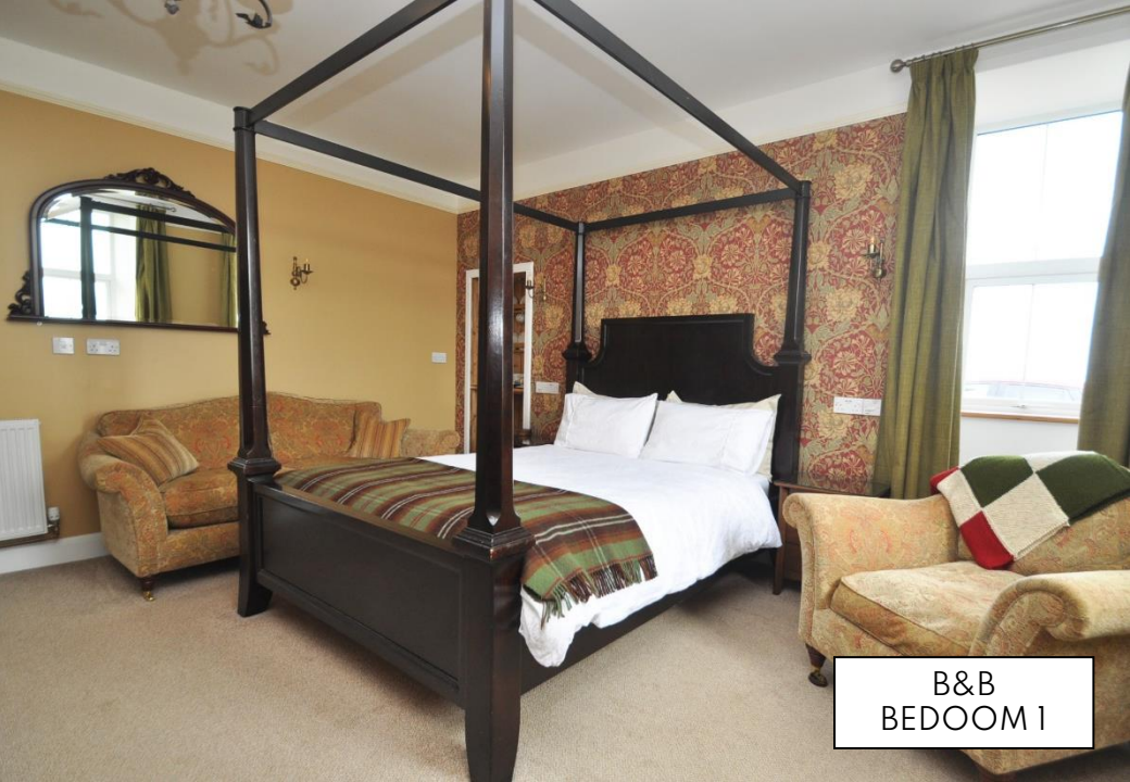
B&B BEDROOM 1