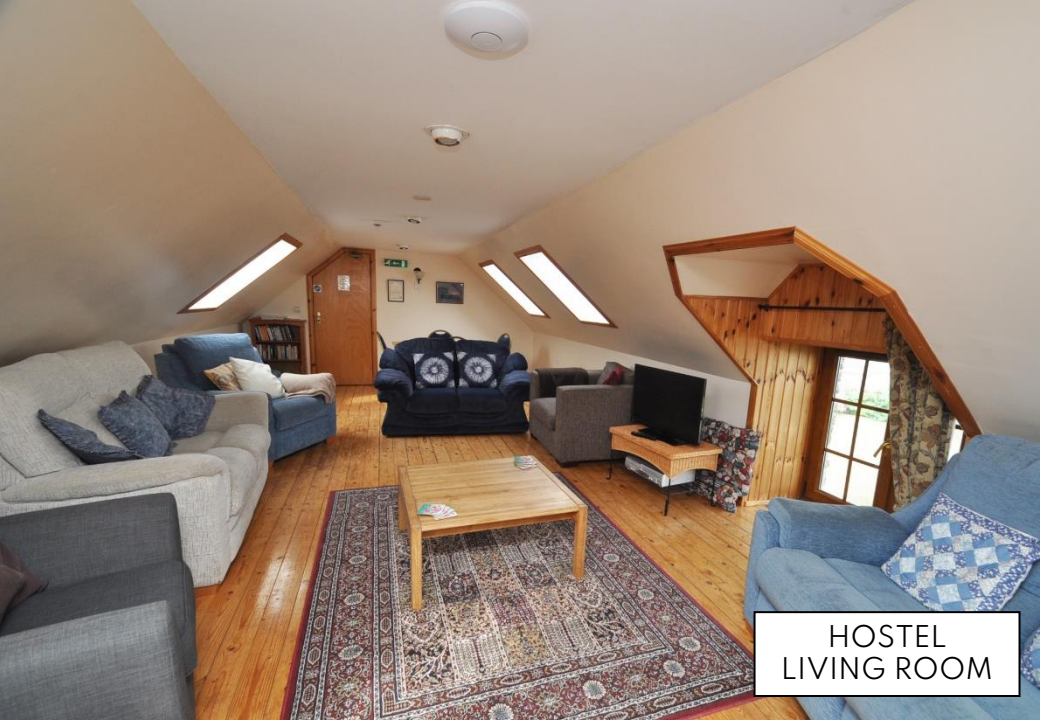
HOSTEL LIVING ROOM