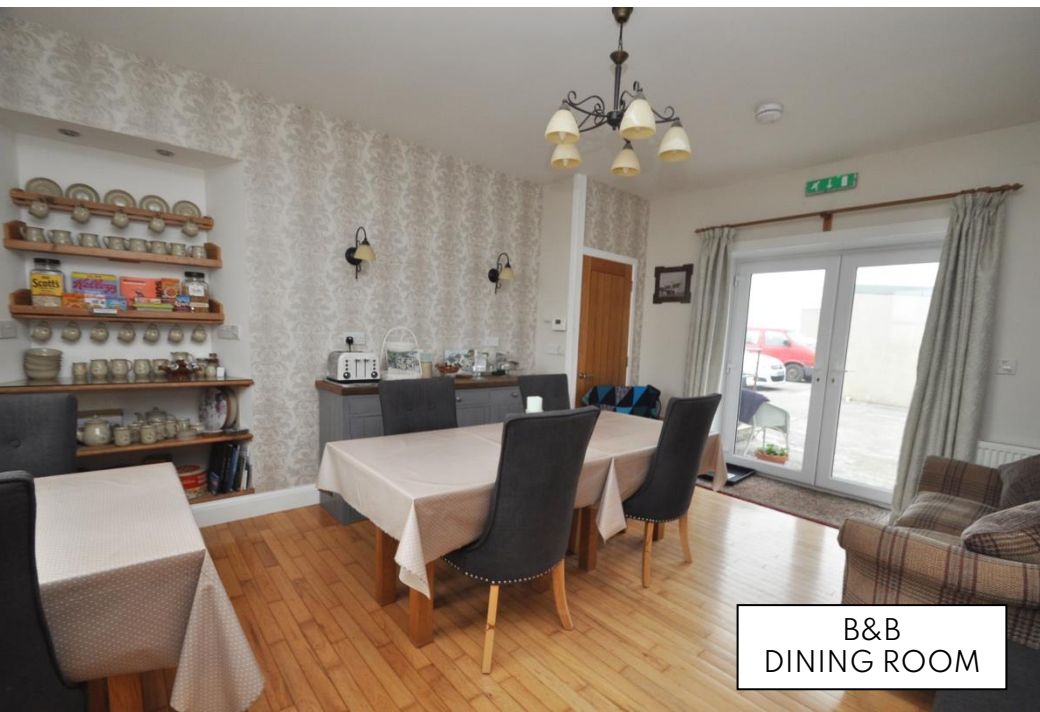
B&B DINING ROOM