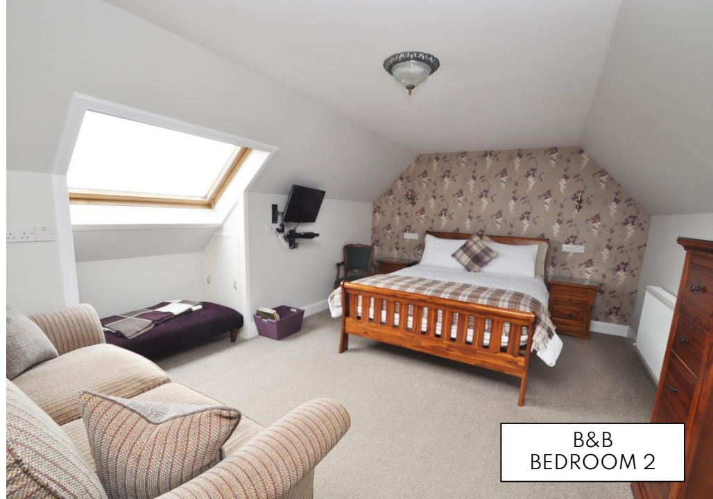
B&B BEDROOM 2