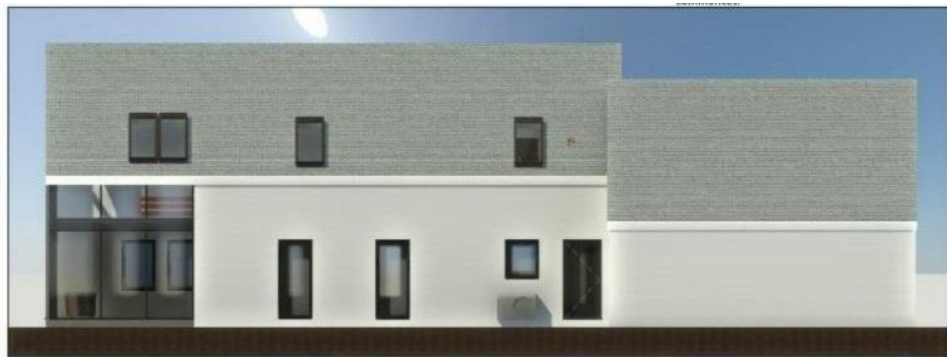
South West 1 : 100