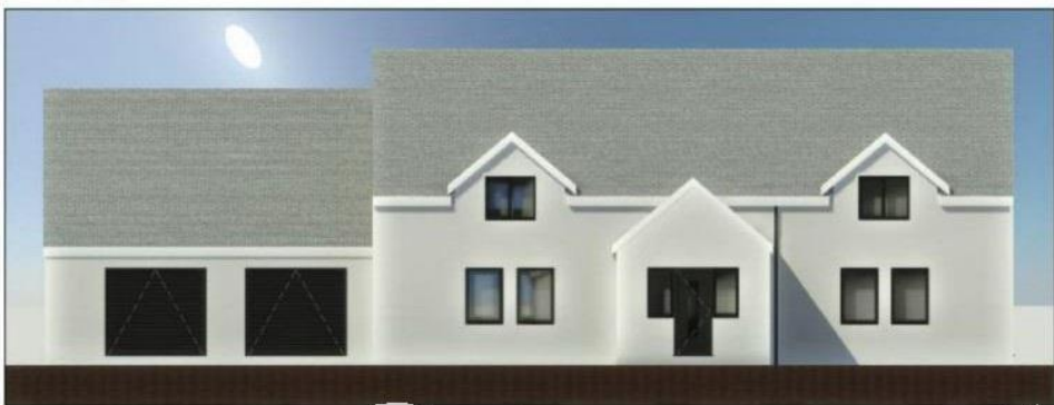
North East 1 : 100